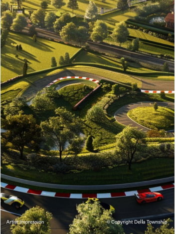
Della Global Motorscape Township: Panshet Resort & Private Residences 100 Acres | 250 5-Star Resort Rooms | 400

Private Villa Plots | Adventure Park | Racing