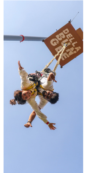
Della Bungee (150ft.)