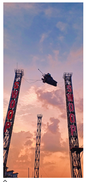
Asia's First Swoop Swing (100ft.)