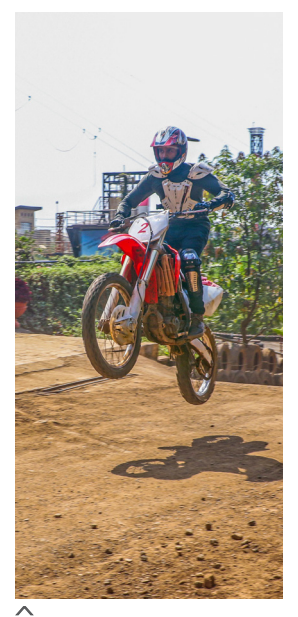
ATV & Motocross Dirt Bike Riding Track