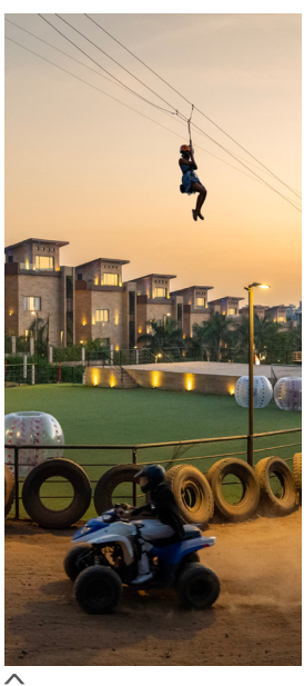
India's Longest Flying Fox (1250ft.)