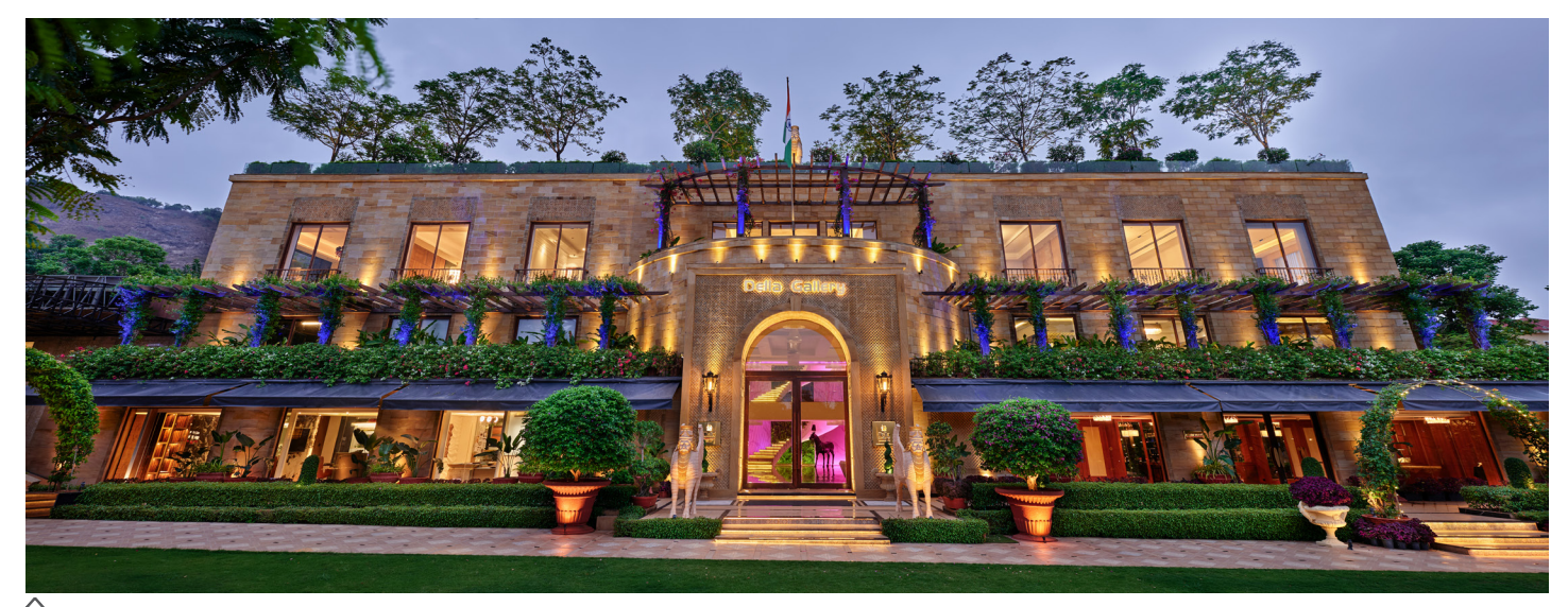
Della Gallery - 4 Banquets