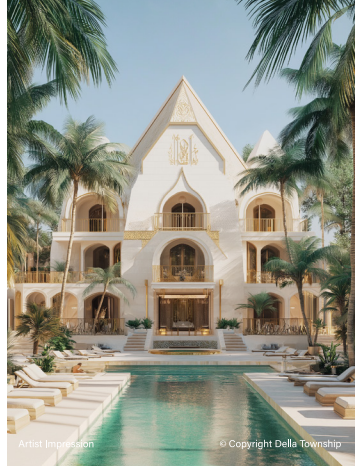
Della Wellness Resort & Private Residence: Goa Resort & Private Residences 7 Acres | 30 Glamping Tents | 41 Private Villa Plots

Private Villa Plots | Adventure Park | Racing