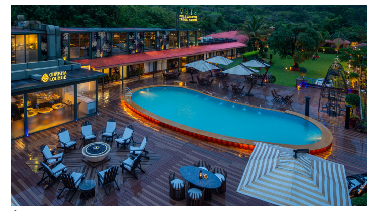
\widehat{D} .A.T.A. Military Themed Glamping Resort