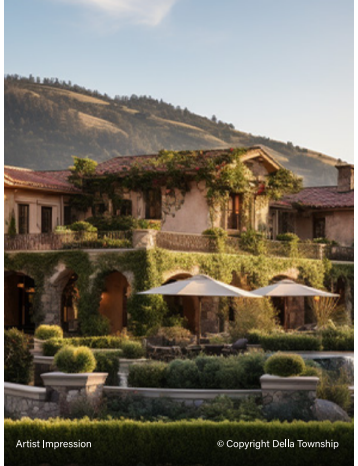
Igatpuri Resort and Private Residences 100 Acres | 125 5-Star Resort Rooms | Adventure Park | 3000+ Labels making it India's Largest Global Wine Retail Experience Center