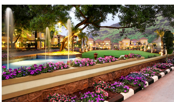
A Enclave Villa Resort