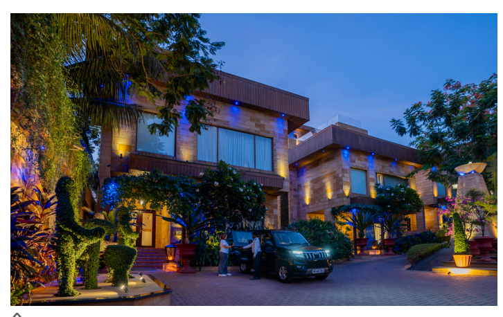
Della Adventure Resort