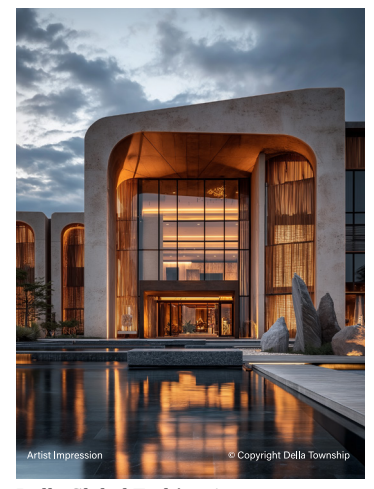
Della Global Fashion Art & Architecture Foundation: Kashid Resort and Private Residences 90 Acres I 250 5-Star Resort Rooms I 400 Private Villa Plots I Water Sports & Adventure Park | Fashion, Art & Architecture Exibition Centre

Resort & Private Residences 30 Acres I 5-Star Boutique Glamping Resort I 137 Private Villa Plots I 4 Branded Residential Towers I Race Course & Adventure Park