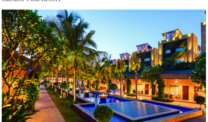
Della Luxury Resort